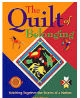
The Quilt of Belonging Stitching Together the Stories of a Nation

Soft cover book: $16.95 x _____ # of copies