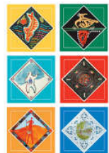
Note Cards and Bookmarks

Series 1 Small Note Cards (pkg of 6): $10.00 x _____ # of packages