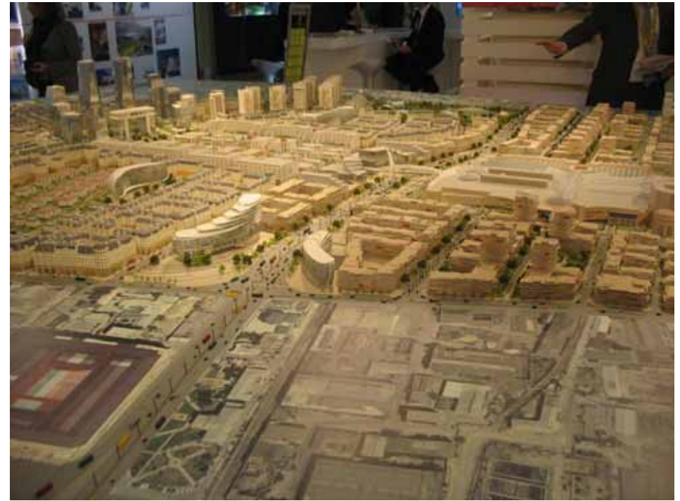
City of London, England