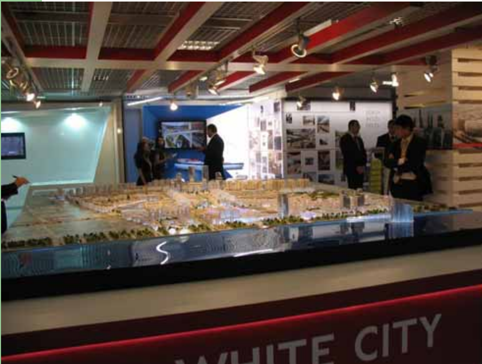
Baku White City, Russia