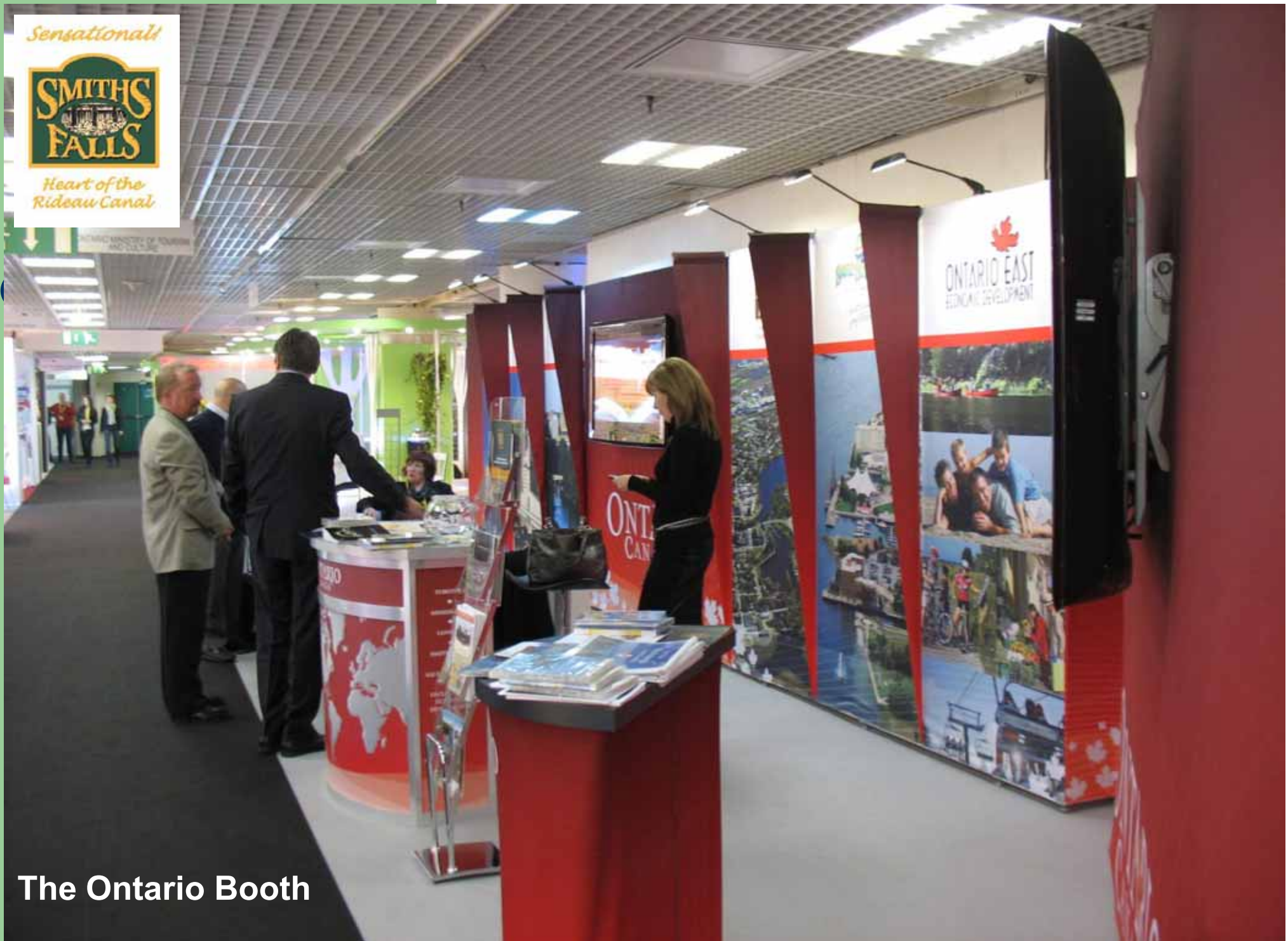
The Ontario Booth