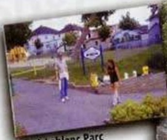
Aimé Leblanc Parc