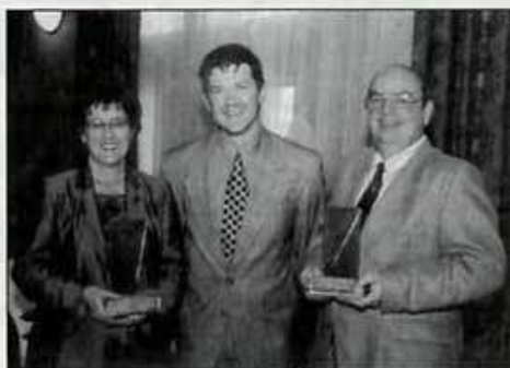
Receiving the 2001 Canadian Urban Institute Brownie Award.

GRG is also active in the promotion and organization of World Changers, a mission-led program which will bring hundreds of American youths into S,D and G this summer to work on community-based projects.