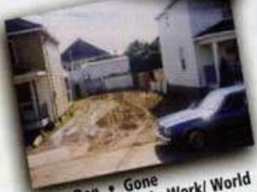
Drug Den • Gone (Thanks to Ontario Work/ World Changers & Private Sector)